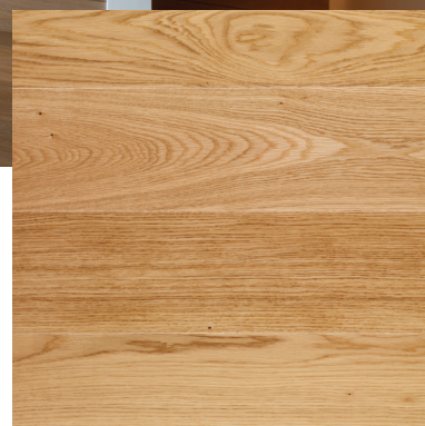
Naked Oak Natural