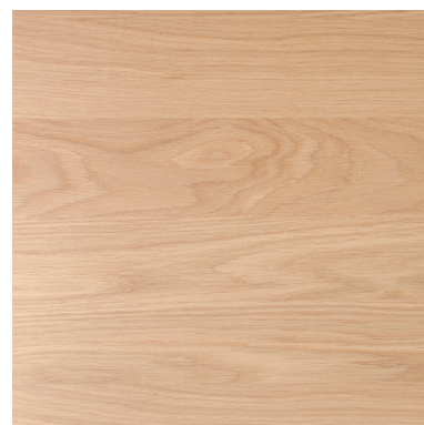
Naked Oak Raw