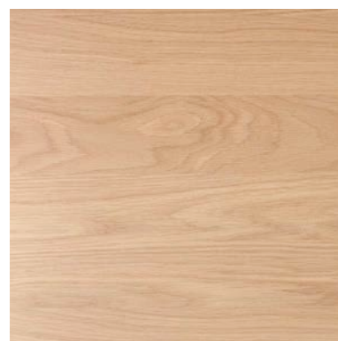
Naked Oak Raw